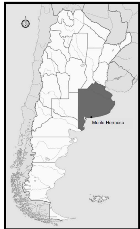
FIGURE 1: MONTE HERMOSO LOCATION, BUENOS AIRES PROVINCE, REPÚBLICA ARGENTINA.

The Carbon Footprint is one of the measurements of the human impact in the environment and is estimated according to the amount of GHG produced, measured in units of Carbon Dioxide (CO 2 ). It serves to quantify direct or indirect emissions sources, in this case the indirect ones produced by the groundwater catchment. This measurement allows the implementations of actions to reduce them, creation of awareness to minimize global warming, and decrease energy costs due to activity. The energy consumption of the catchment pumps is used. These values are obtained from the billing of the service of the year 2017. The purpose is to estimate the annual and monthly Carbon Footprint, generated by the Monte Hermoso drilling park. A methodology for the collection and analysis of information is presented, which may be applicable in other water services. The guidelines of ISO 14064-1 are used as reference.