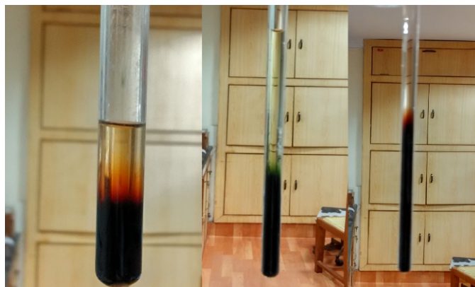
Fig 2: Showing layering tube and crystal structure obtained by layering method

Layering can be done in the NMR, or glass tube (as shown in figure). It must be very careful ([Fig 2]).