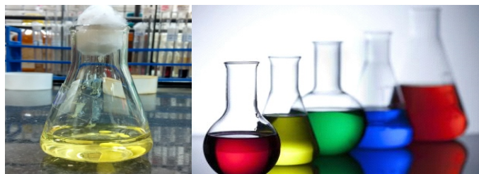
Fig 3: Representation of slow evaporation method

Generally most of the compounds crystallize out by this method and this is the easiest method among all methods. First step is- filter to remove any particles and allow the material to crystallize out as the solvent evaporates. Keep the solution clean and covered to avoid dust particles (Figure 3).